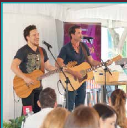
Sony Music artist Pete Murray performing at the fundraising luncheon