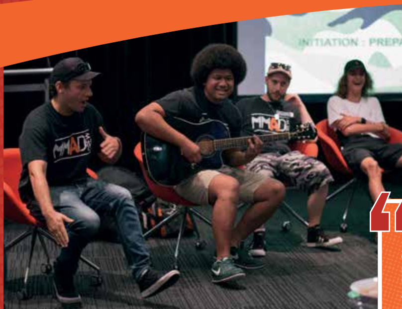
MMAD mentors leading the group through song