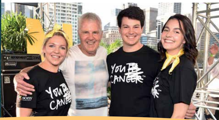
Sony Music artist Daryl Braithwaite with some of our incredible You Can Champs