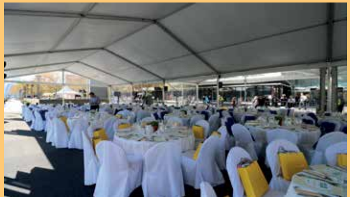
A beautiful set up.... the marquee from No Fuss Marquees just before River4Ward 2017 commenced

Choices, choices! A refreshing Mountain Goat beer or a G.H.Mumm champagne on arrival.