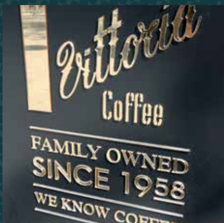
Melbourne knows their coffee so luckily we had only the best on hand