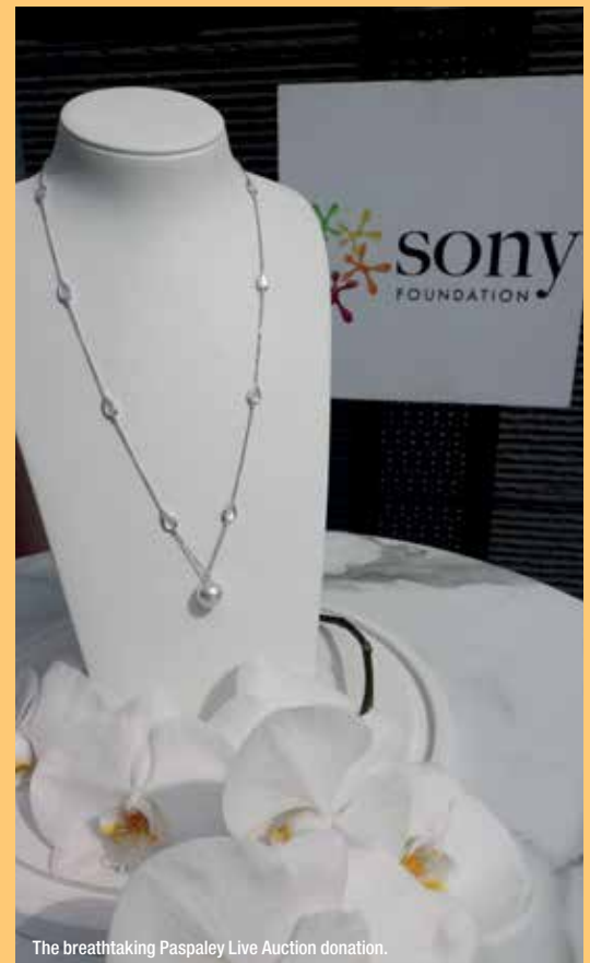
The breathtaking Paspaley Live Auction donation.

Crown, G.H.Mumm Champagne, Mountain Goat, Fox Gordon, Santa Vittoria, Vittoria Coffee, Fourth Wall, Zagame Ferrari, Paspaley, DHL, No Fuss Event Hire, WINK Models, Cloakroom Media, Jim Lee Photography and Woofys.