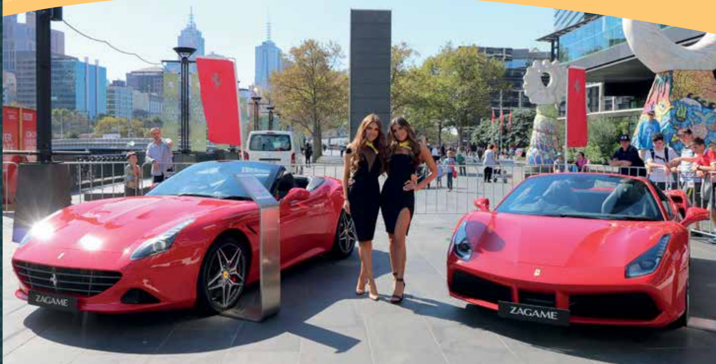
Glamorous WINK models with Zagame Ferrari's equally glamorous display