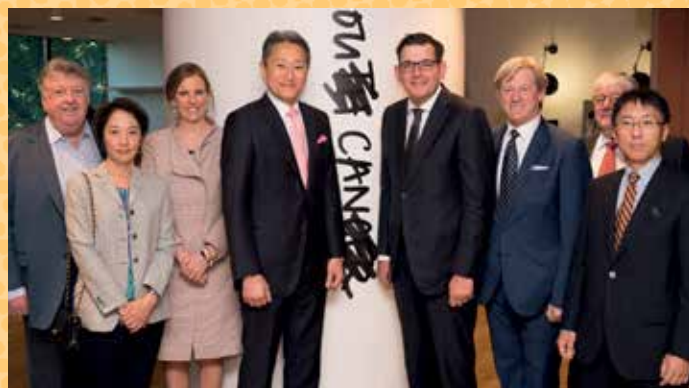
President and CEO Sony Corporation Kazuo Hirai with Premier of Victoria, the Hon. Daniel Andrews and Sony Foundation Board of Directors.