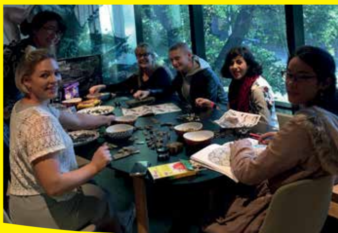
Melbourne's You Can Crew making the most of the Melbourne You Can Centre for Gaming4Life