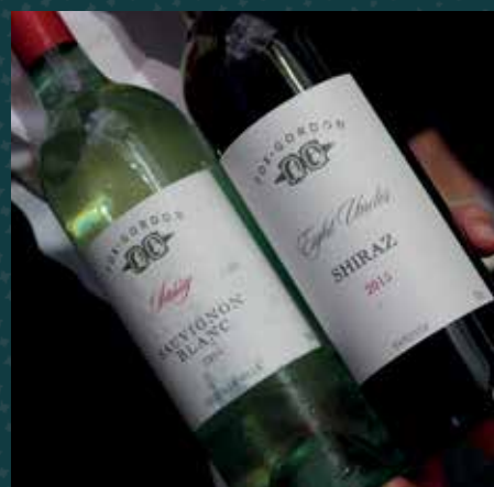
Just some of Fox Gordon's delightful drops