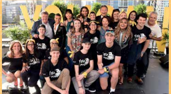
Smiles all round after an epic River4Ward event

The genuine interest in the Foundation from Kaz Hirai and his global team has garnered attention and admiration from Sony markets globally who are impressed by the collaborative efforts of Sony companies and their business partners to unite for such a special cause.