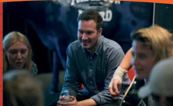
Sony Music staff and their MMAD STARS prepping for the rap battle

“...I feel like I belong. Not getting any negativity from anyone. Having the MMAD fam is the best thing in the world!”