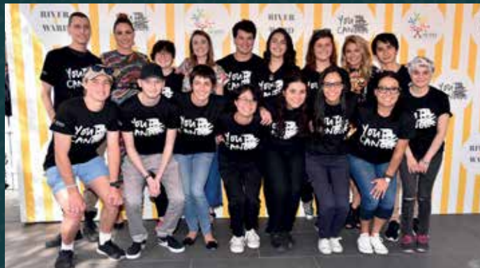
This year's amazing You Can Crew with hosts Giaan Rooney and Sony Foundation ambassador, Natalie Bassingthwaite