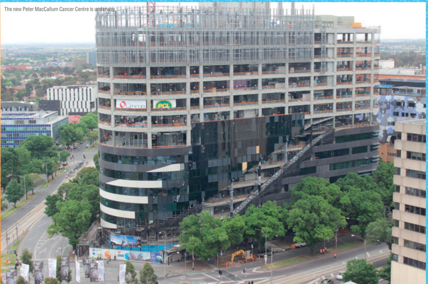
The new Peter MacCallum Cancer Centre is underway.