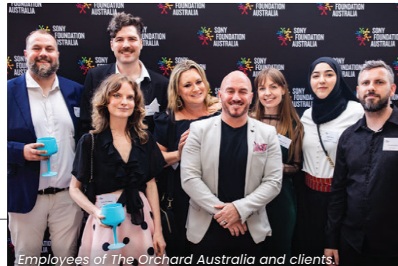
Employees of The Orchard Australia and clients.