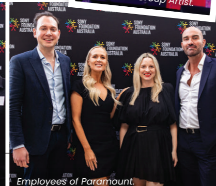
Employees of Paramount.