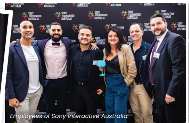
Employees of Sony Interactive Australia.