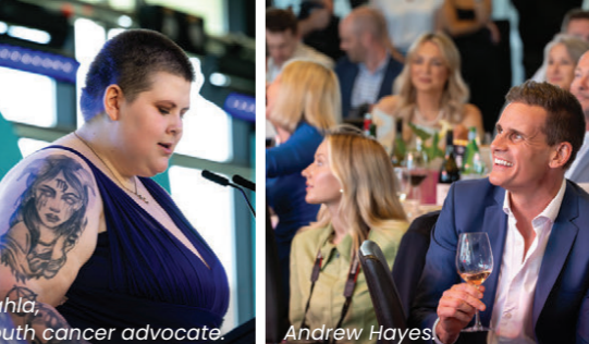
Kahla, youth cancer advocate.