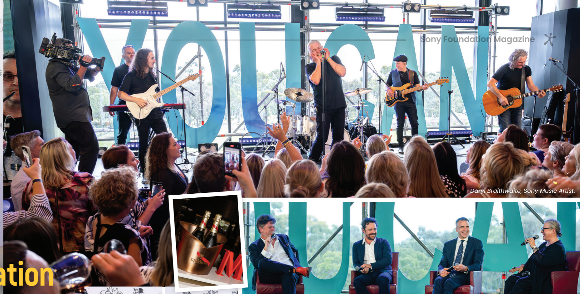
Daryl Braithwaite, Sony Music Artist.