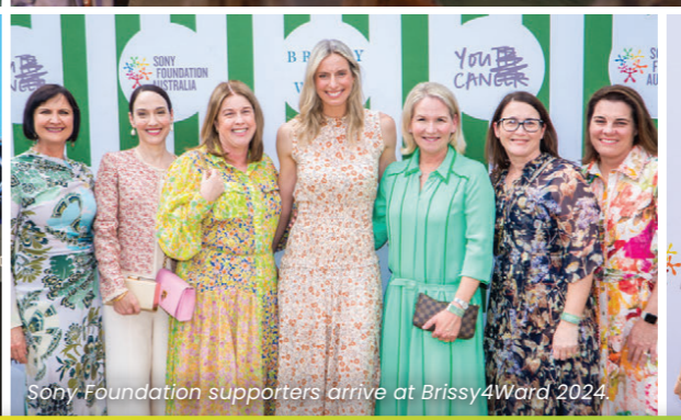
Sony Foundation supporters arrive at Brissy4Ward 2024.