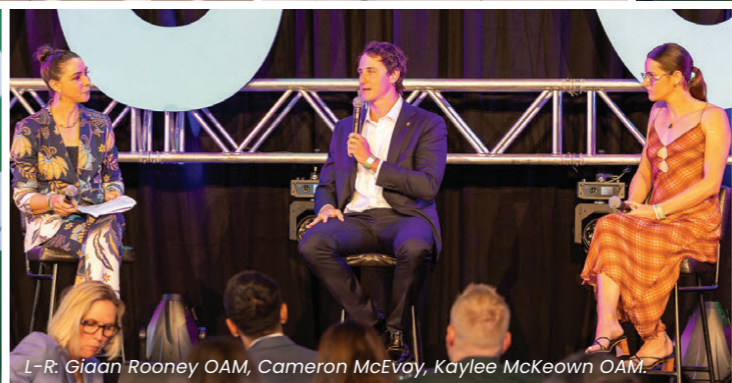
L-R: Giaan Rooney OAM, Cameron McEvoy, Kaylee McKeown OAM.