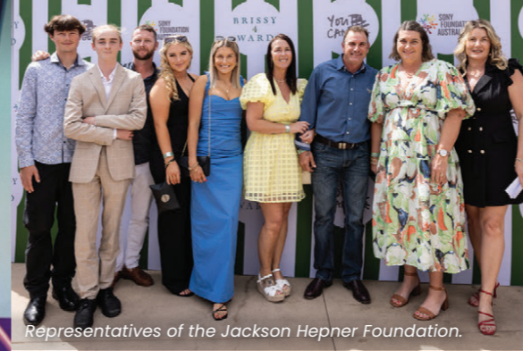
Representatives of the Jackson Hepner Foundation.