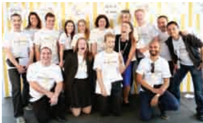
Our amazing event volunteers

The event would not have been possible without the support of our fabulous sponsors who made all of this happen; it really was an event like no other. We would like to say a huge thank you to all of them, we can't wait to do it all again next year!