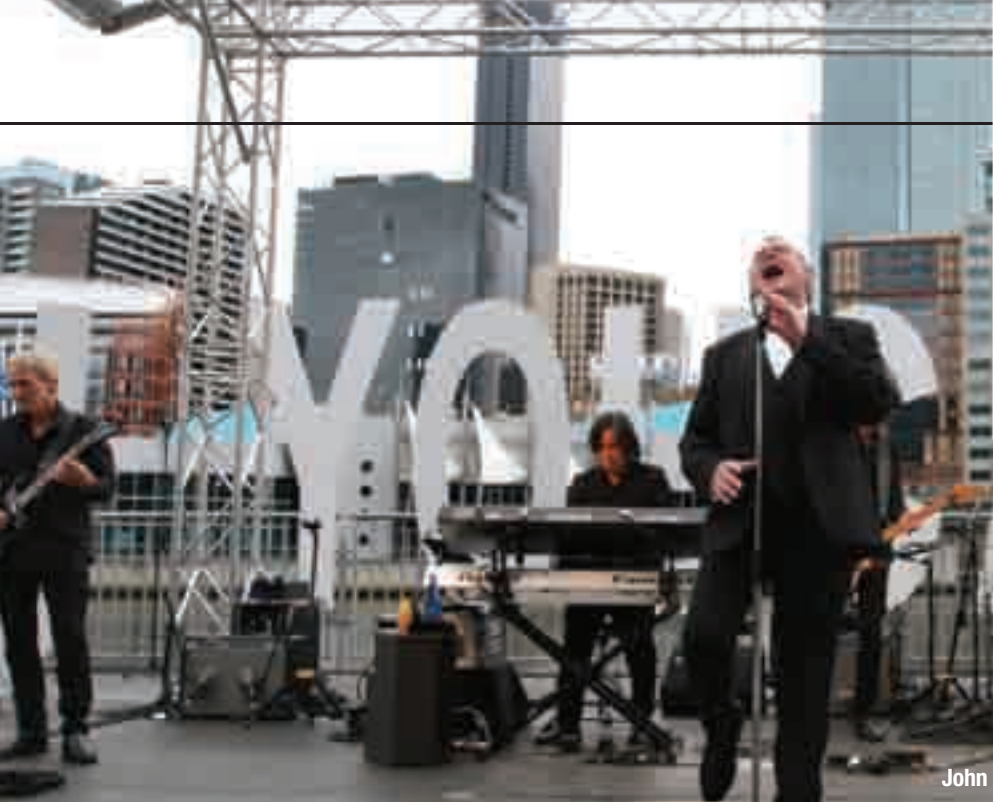
John Farnham's closing performance brought the house down