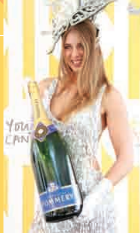
Pommery hosted a fabulous sparkling reception