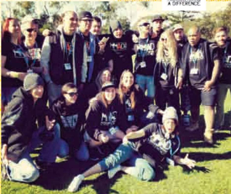
The MMAD family at 351 Camp in May