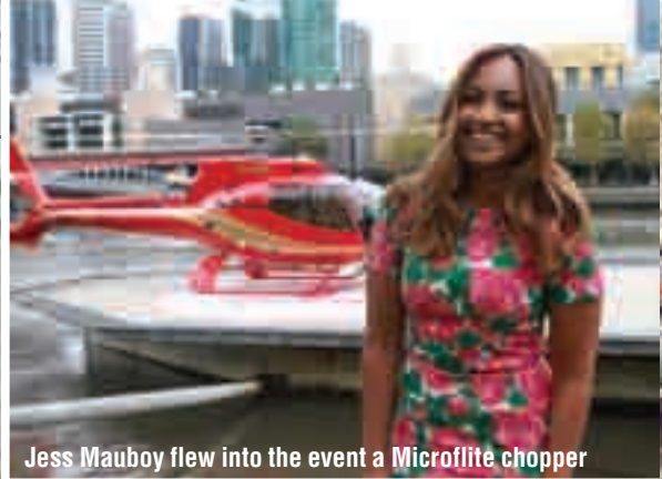
Jess Mauboy flew into the event a Microflite chopper