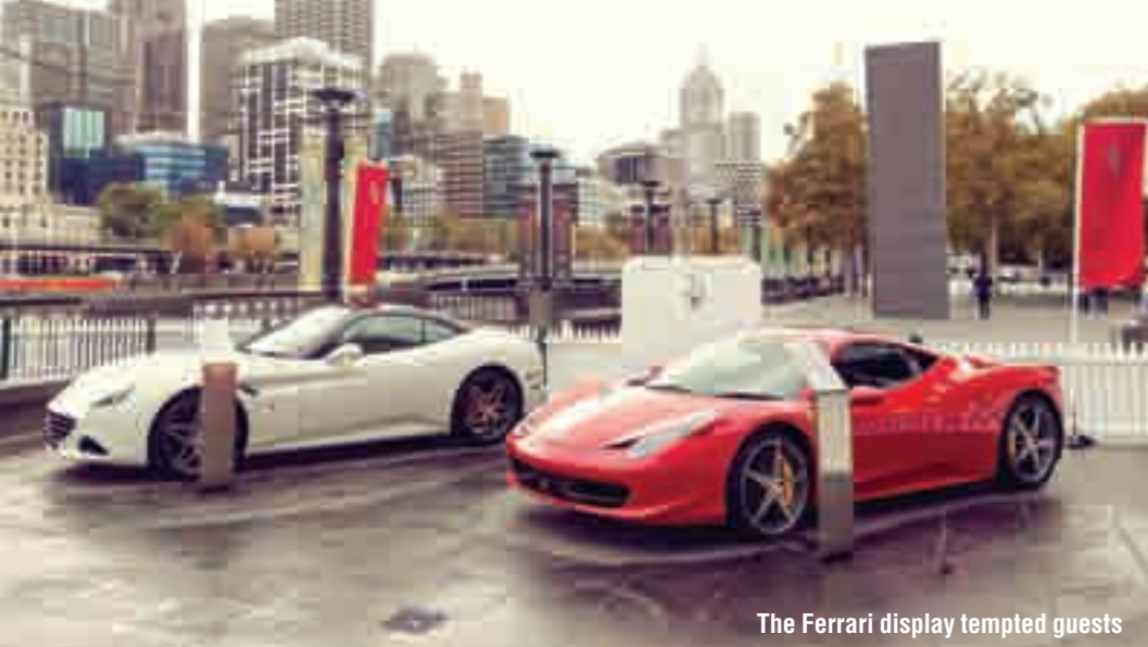
The Ferrari display tempted guests