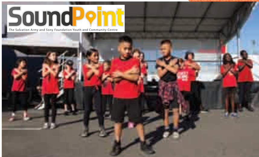
From top: MMAD's Goodna Street Dreams crew performed at Youth Week; The event attracted 350 people to SoundPoint

Shortly before the event started, Ipswich City Council hosted a Youth Forum in the Sony Space, attended by young people from the region who wished to express their ideas, experiences and concerns to the Mayor.