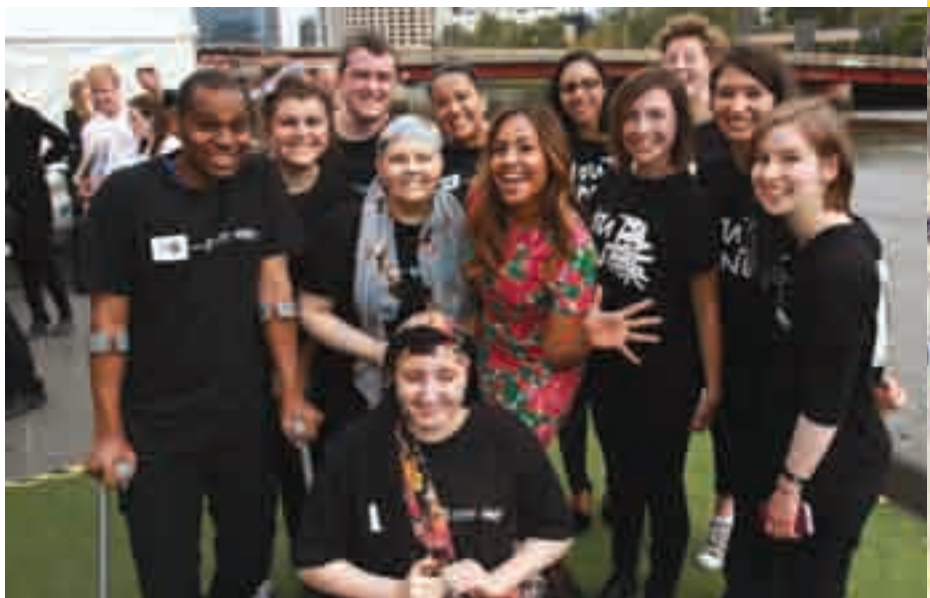
Jess Mauboy with our Melbourne You Can Crew

A big shout out to Nivea, Gourmet Traveller, Carman's, Citizens of the World and Peppermint Grove as well.