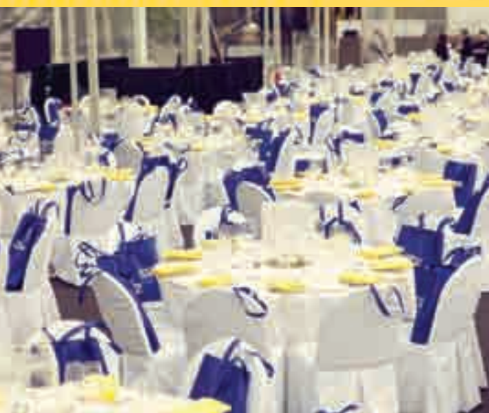
The marquee made the most of the stunning location