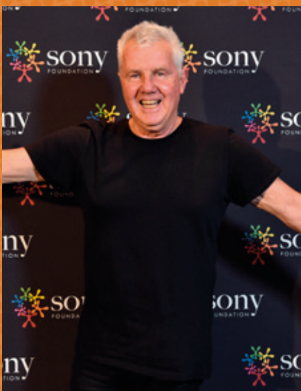
Sony Music artist and You Can supporter Daryl Braithwaite celebrating the opening of Melbourne's You Can Centre