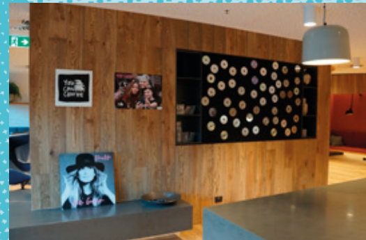
Melbourne's new You Can Centre