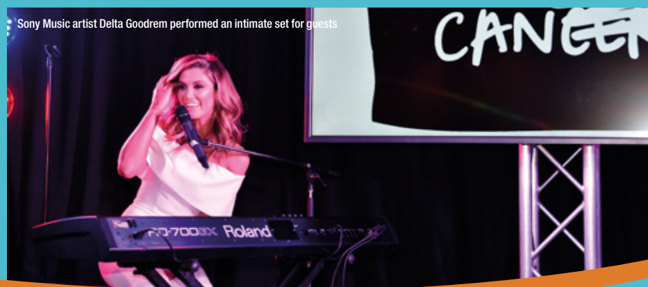
Sony Music artist Delta Goodrem performed an intimate set for guests

Sony Foundation would like to thank all our Corporate Partners, donors and supporters of this landmark project. With the launch of River4Ward into Melbourne, we are extremely grateful for the generosity of our supporters to make this much-needed Centre a reality. The unique partnership and support of the Peter MacCallum Cancer Centre has made the build of Australia's second You Can Centre a wonderful success and we look forward to continuing this partnership with the Peter Mac team as together, we strive to improve youth cancer care.