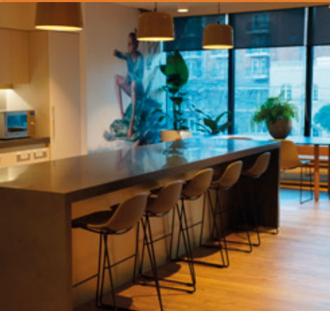
Kitchen area in new You Can Centre