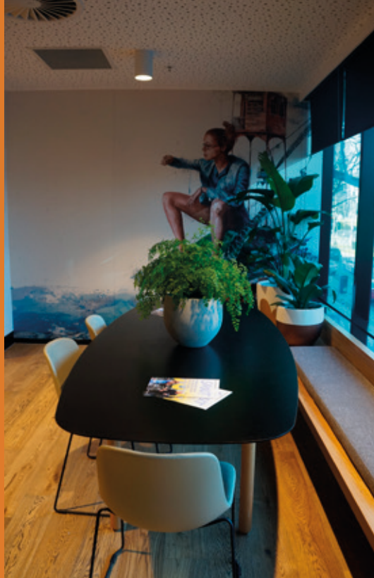
A relaxing dining area in the new You Can Centre