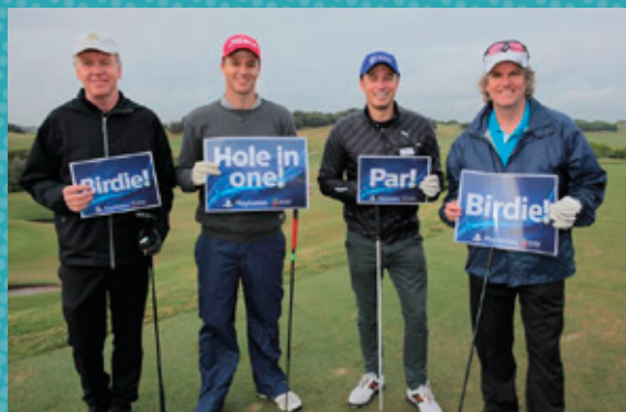
Happy golfers in a moment of clear weather