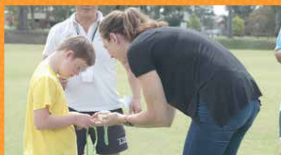
Getting presented with a medal from a gold medal winning Olympian!!