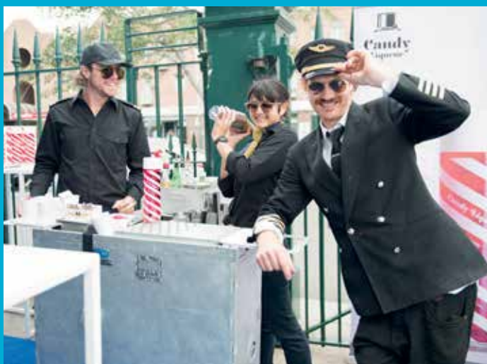
The high-flying crew from Trolley'd