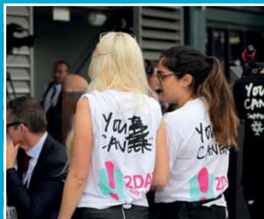
Our incredible volunteers in their SCA sponsored shirts