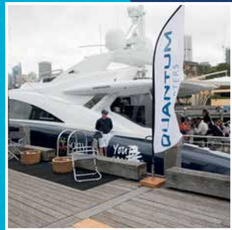
The luxurious super yacht, Quantum, which this year guests dined on!