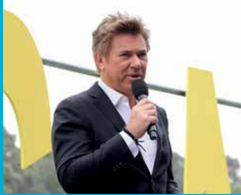
Sony Foundation ambassador and Wharf4Ward host, Richard Wilkins