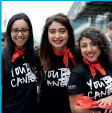
You Can champions enjoying the day!

Thanks must also go to our amazing volunteers, our wonderful You Can Crew, generous prize donors and all who contributed to making the day such a standout success!