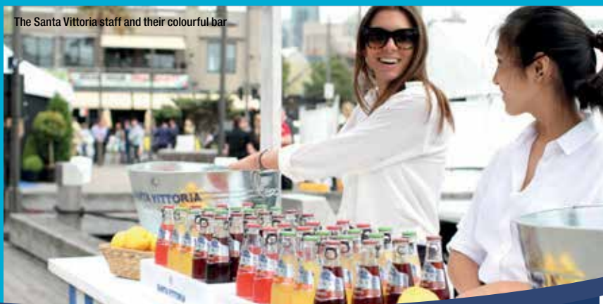
The Santa Vittoria staff and their colourful bar