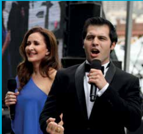
Sony Music artists Marina Prior and Mark Vincent opening the day in spectacular style