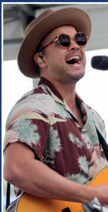
Sony Music artist Guy Sebastian serenading the Wharf