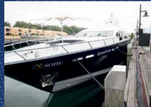
Sleek super yacht, Quantum