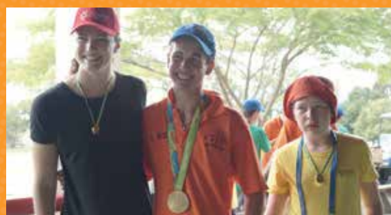
Olympic champion Cate Campbell and some very happy campers with their medals