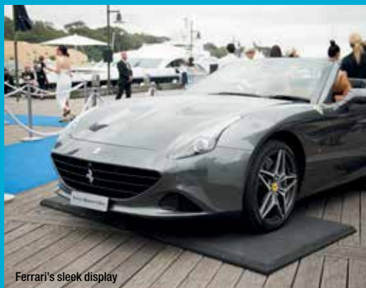
Ferrari's sleek display

AKIS, china Doll, Criniti's, Kingsleys, Manta, Otto, Fourth Wall, The Tilbury, Heineken, Pommery, Ovolo, Fox Gordon, Ferrari, DHL, Southern Cross Austereo, Santa Vittoria, Quantum, WINK Models, House of K'Dor, Vittoria Coffee, VBM, TPR, Grays Online, Candy Liquer, Trolley'd and Quantum.