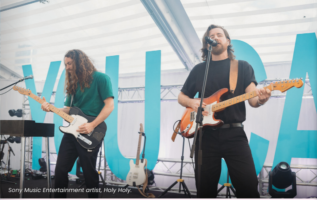
Sony Music Entertainment artist, Holy Holy.