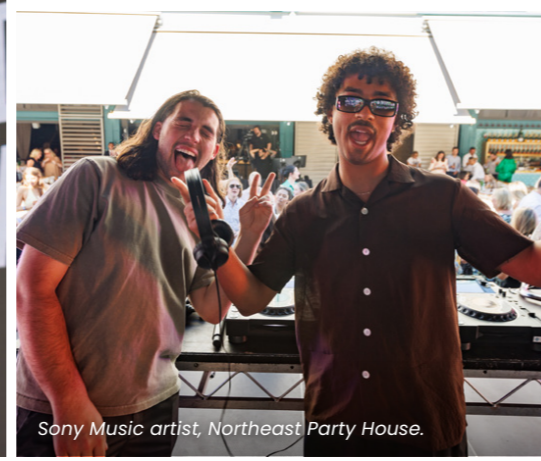
Sony Music artist, Northeast Party House.