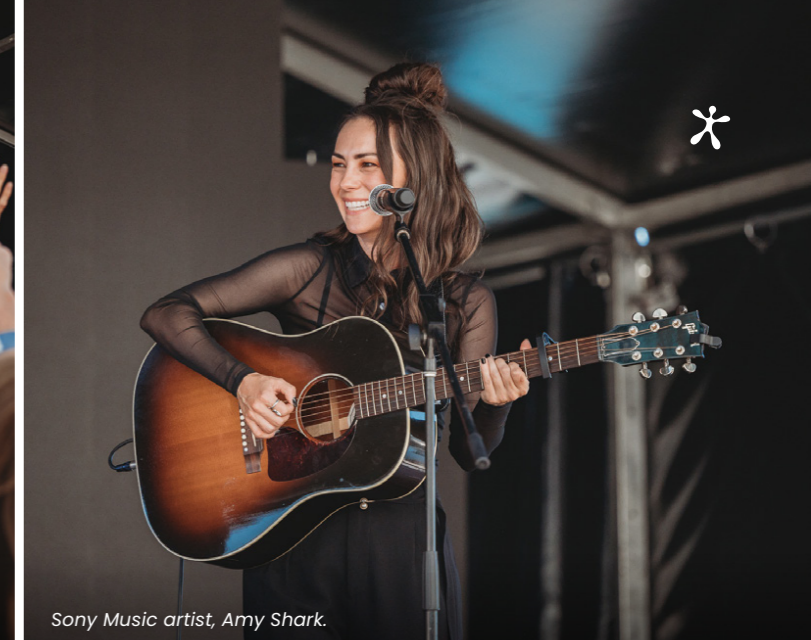
Sony Music artist, Amy Shark.