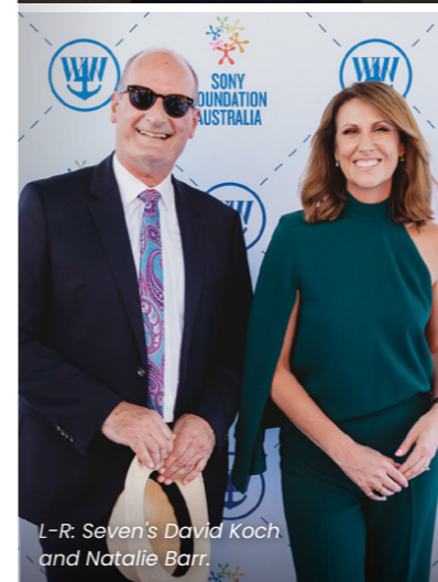
L-R: Seven's David Koch and Natalie Barr.

To enquire about Sony Foundation's 4Ward event series and corporate or event partnership opportunities, visit: sonyfoundation.org/events