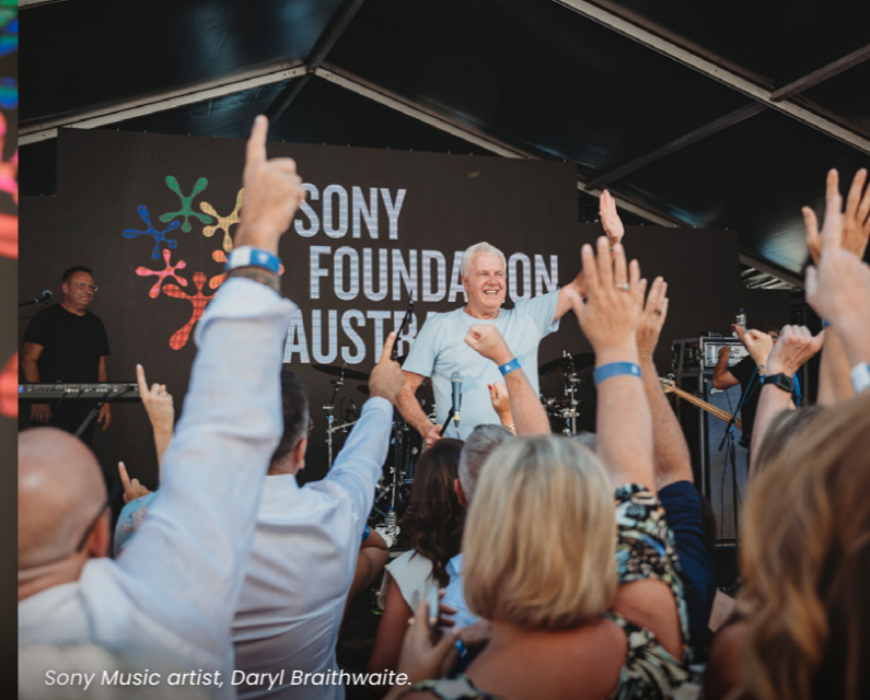
Sony Music artist, Daryl Braithwaite.