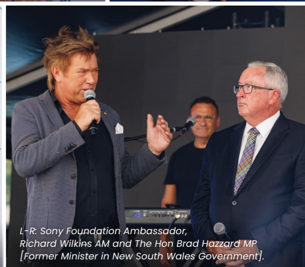
L-R: Sony Foundation Ambassador, Richard Wilkins AM and The Hon Brad Hazzard MP [Former Minister in New South Wales Government].