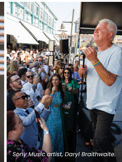
Sony Music artist, Daryl Braithwaite.