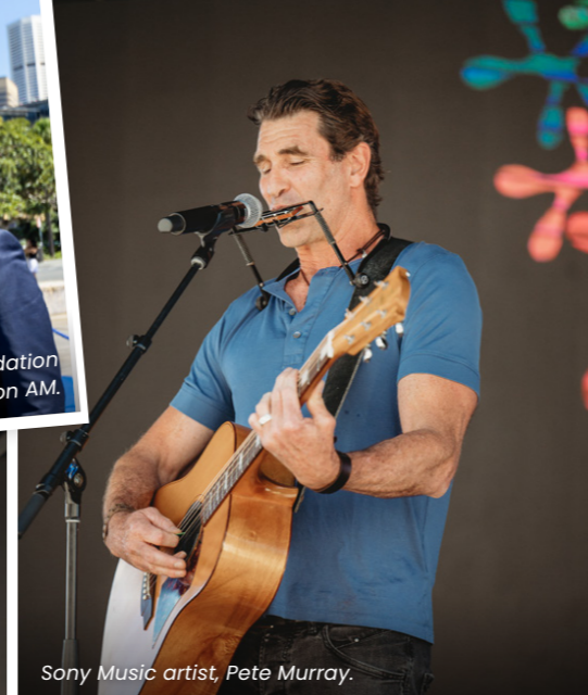
Sony Music artist, Pete Murray.