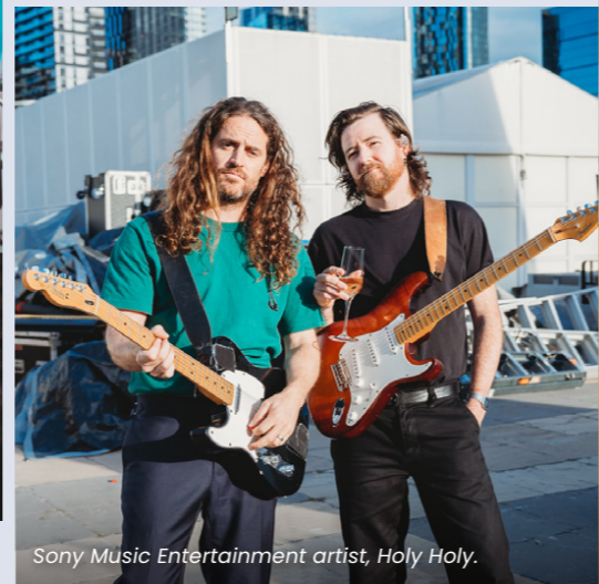
Sony Music Entertainment artist, Holy Holy.