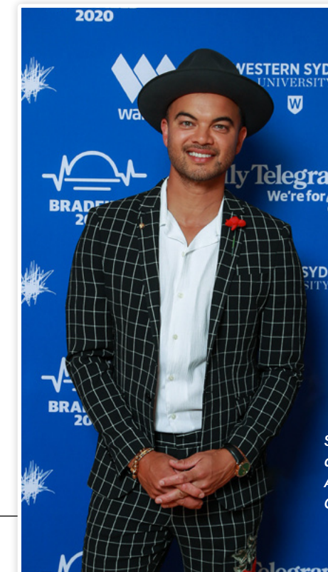
Sony Music Artist and Sony Foundation Ambassador, Guy Sebastian

industry leaders from infrastructure, tourism, hospitality, entertainment and government to discuss the future of Sydney with an address by NSW Premier Gladys Berejiklian. The event resulted in major donations that raised a total of $87,000. A highlight of the day was the opening performance by Sony Music Artist and Sony Foundation Ambassador Guy Sebastian, who brought world class entertainment to the event. ●