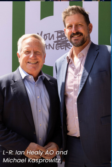
L-R: Ian Healy AO and Michael Kasprowitz.