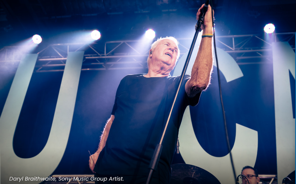
Daryl Braithwaite, Sony Music Group Artist.