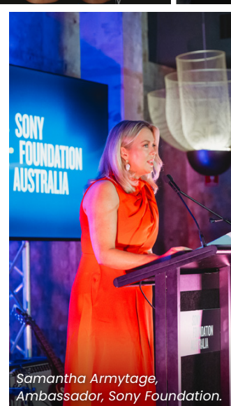
Samantha Armytage, Ambassador, Sony Foundation.