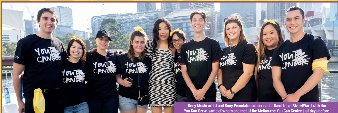
Sony Music artist and Sony Foundation ambassador Dami Im at River4Ward with the You Can Crew, some of whom she met at the Melbourne You Can Centre just days before.