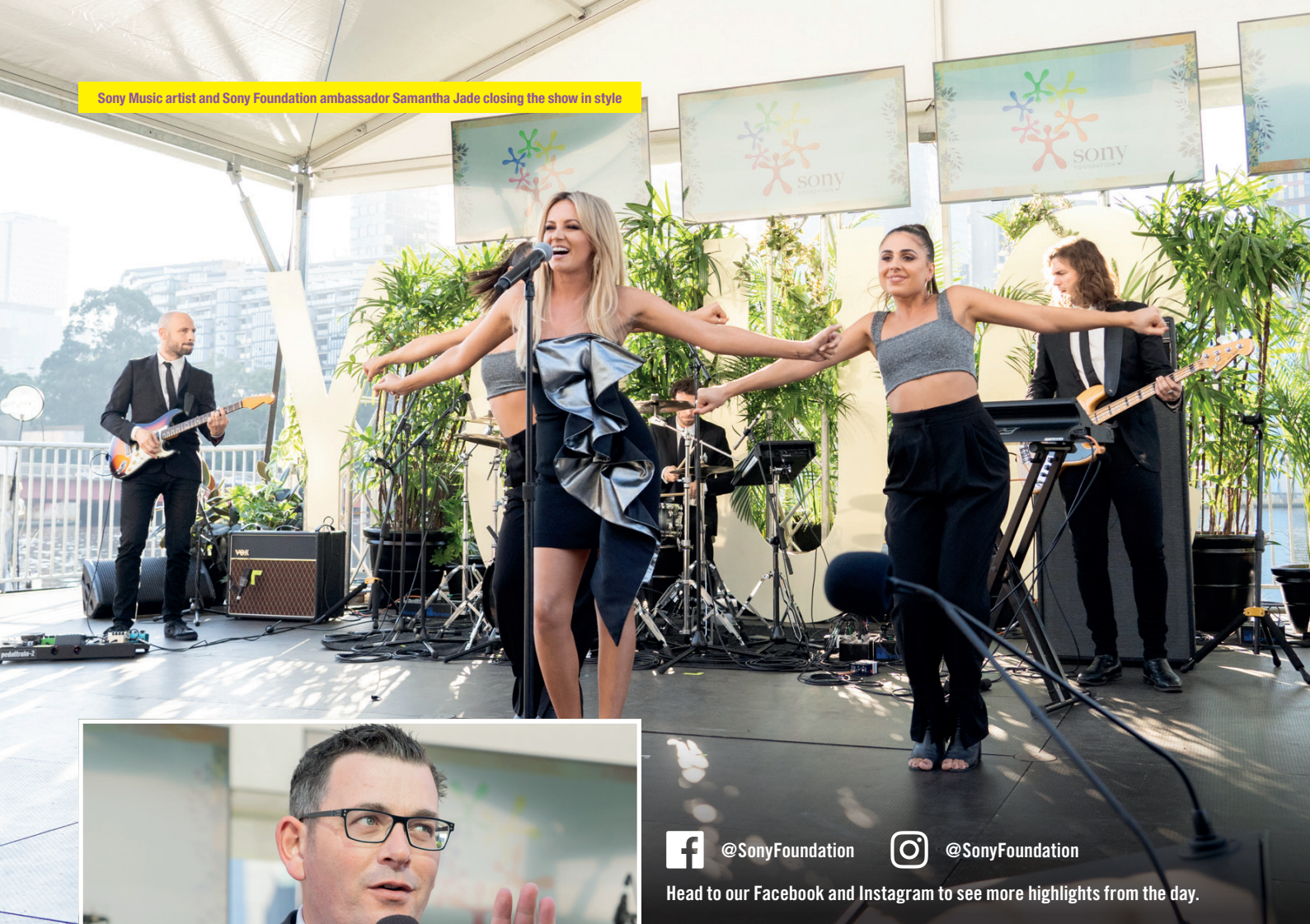
Sony Music artist and Sony Foundation ambassador Samantha Jade closing the show in style