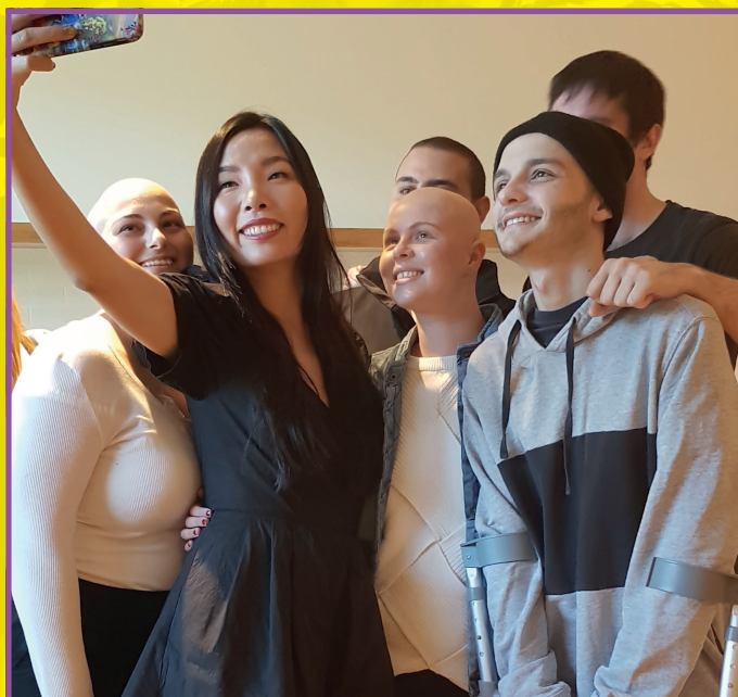
Dami Im and Melbourne You Can Champs at the Melbourne You Can Centre

“ You meet the kids and hear their stories, and you know the You Can Centre helps them through some difficult times. It's nice to use my music and profile to do something meaningful. — Dami Im, Sony Foundation ambassador ”