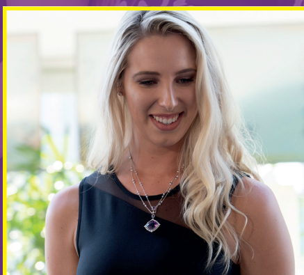
The bespoke Cerrone necklace, created specifically for River4Ward, modelled by a WINK model during the live auction