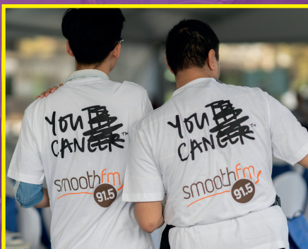
Volunteers kitted out in their SmoothFM t-shirts