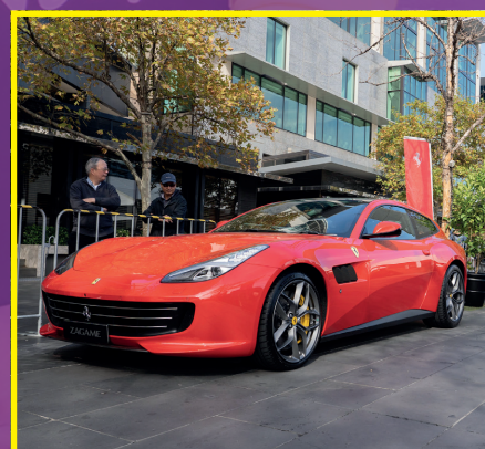
An impressive welcome sight from Zagame Ferrari's offerings