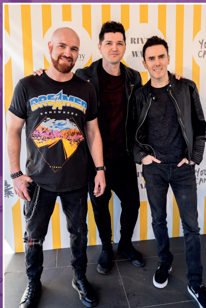
Irish rockers, The Script, arriving at River4Ward 2018

Sony Music artists including leading international act, The Script and home-grown stars Amy Shark, Dami Im and Samantha Jade brought the wow factor to the event performing from River4Ward's infamous floating stage on the Yarra. The Script's lead singer, Danny O'Donoghue who took time out of during the band's international tour to perform at River4Ward said, "Every one of us knows a cancer survivor or somebody who has been diagnosed with cancer. We need places for young people who are dealing with cancer, where they can talk with people their own age and hang out like teenagers do."