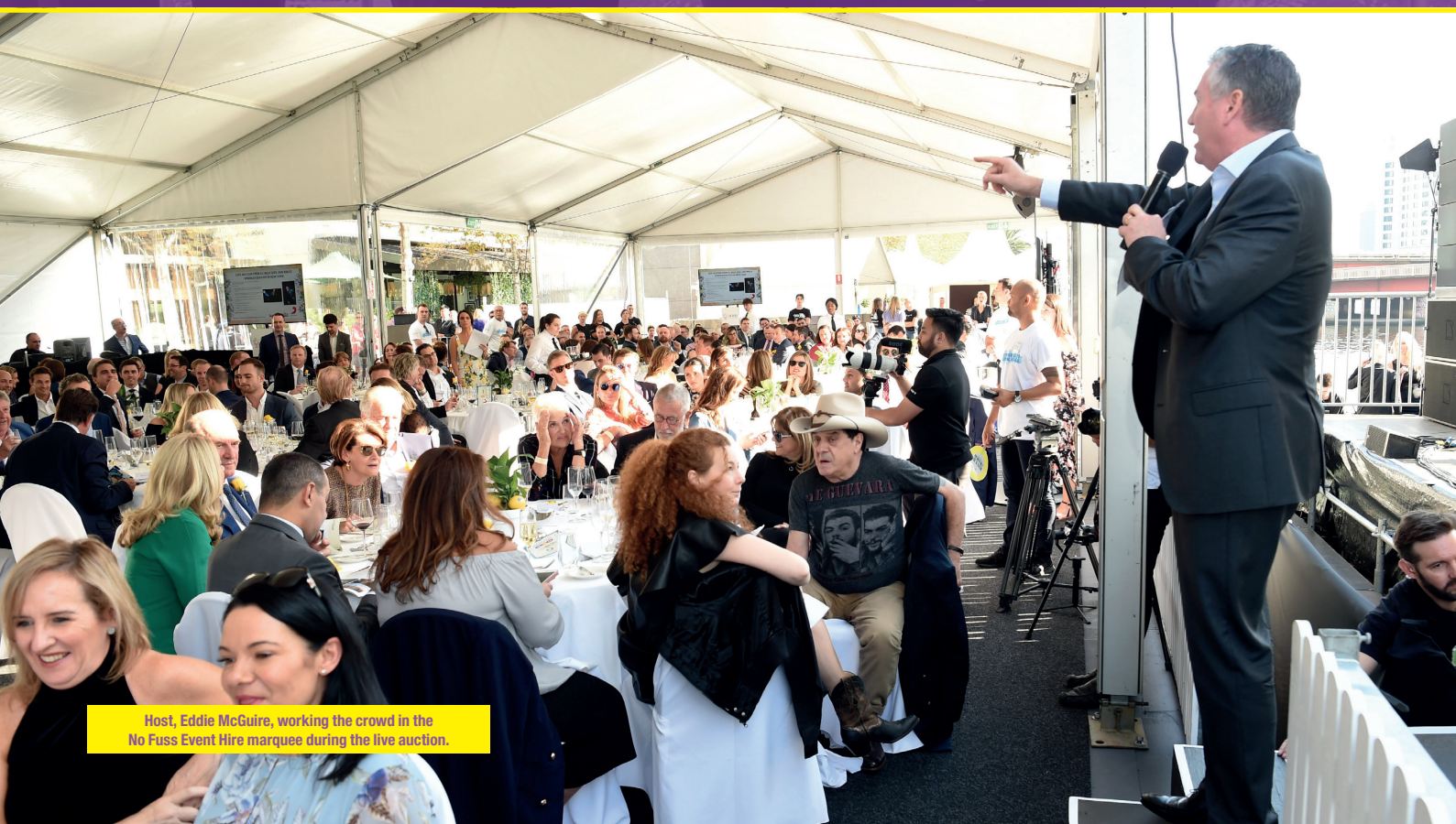
Host, Eddie McGuire, working the crowd in the No Fuss Event Hire marquee during the live auction.