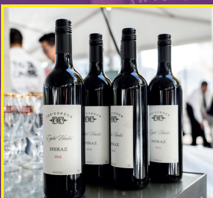
A fine drop from Fox Gordon wines