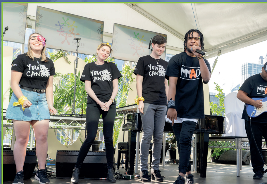
MMAD You Can Tribute performance on River4Ward's infamous floating stage