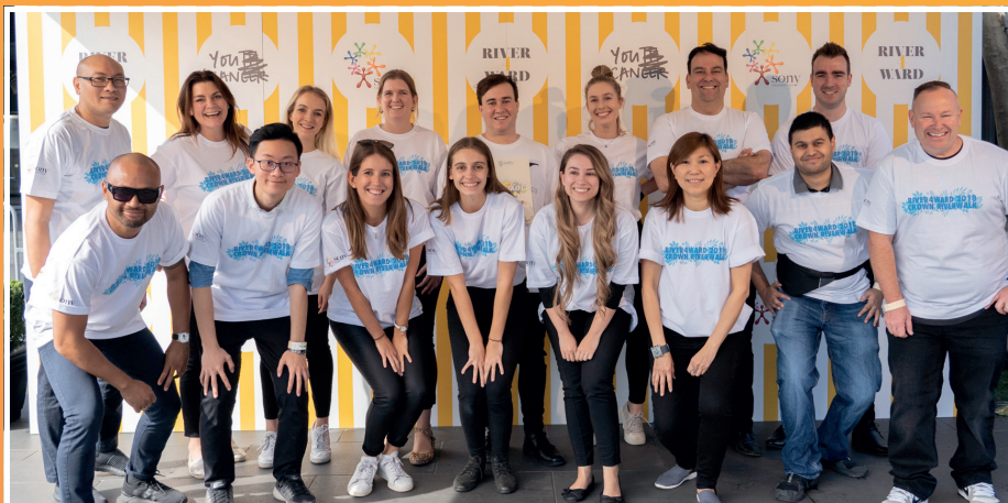
River4Ward's superstar volunteers!

Special thanks to all corporate volunteers from CROSSMARK Melbourne, Sony Australia Melbourne and friends of the Foundation who generously donated their time to help ensure our most successful River4Ward to date!