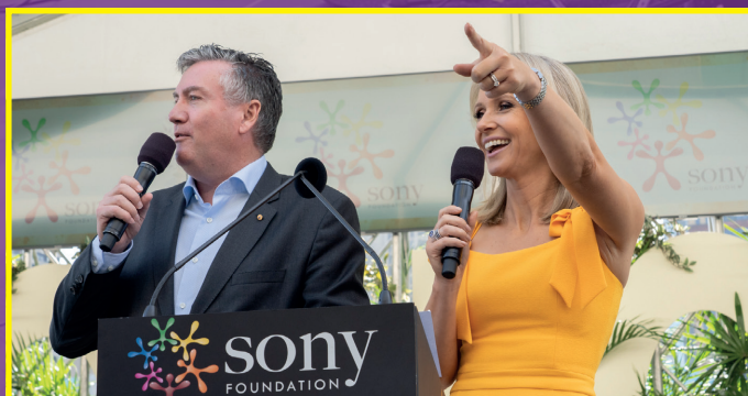
Hosts Eddie McGuire and Livinia Nixon getting our guests pledging their support