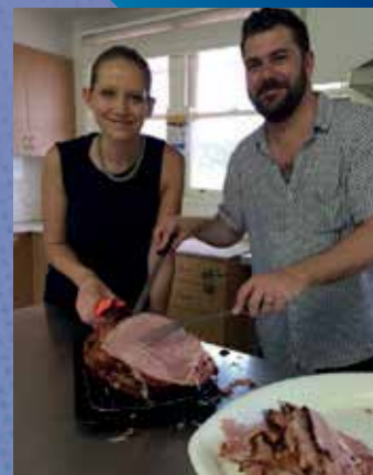
Volunteers and residents getting the Christmas party started