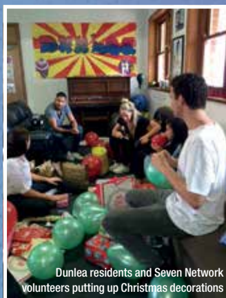
Dunlea residents and Seven Network volunteers putting up Christmas decorations

Each year, some of Sony Foundation's Corporate Partners take the time out of their busy holiday schedules to put into practice the true spirit of Christmas. On Thursday 22nd December 2016, a team of dedicated volunteers from Rainbow Corporate Partner, Channel Seven went along to charity partner Youth Off The Streets youth drug & alcohol refuge 'Dunlea' to cook up a delicious Christmas feast and celebrate Christmas with the young people. Thank you to these wonderful volunteers for spreading the Christmas spirit!