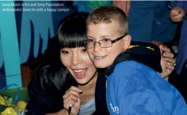
Sony Music artist and Sony Foundation ambassador Dami Im with a happy camper